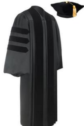
Doctoral Souvenir Set 2061008 $65.99

Please contact Dayla Burgin if you have questions.