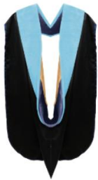
Doctoral Hood 2061012 $32.99