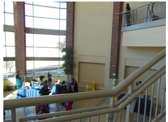
Maximum Thrill, No Kill competition at AIM Day 2014