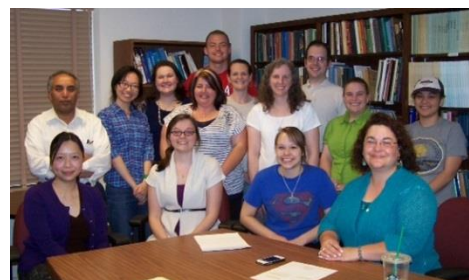
Spring 2014 GA meeting

The First Year Mathematics Program continues to thrive as many more sections of College Algebra, Business Math, and Liberal Arts math are offered. The program has evolved greatly in the past couple of years. In particular, the First Year Math courses are more standardized and faculty and staff have received training in various areas of interest, often including technology.