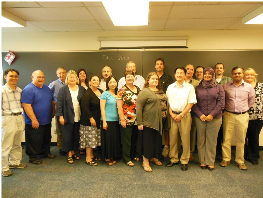
Math Department, Fall 2014