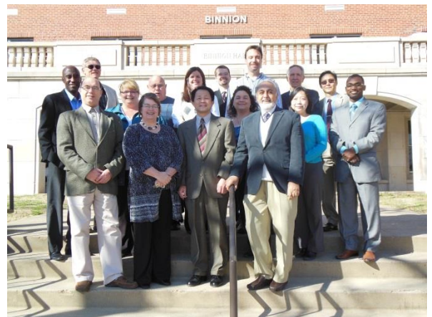
Math Department, Spring 2014