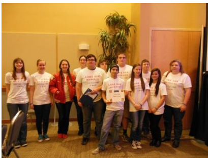
Algebra Competition winners 2014