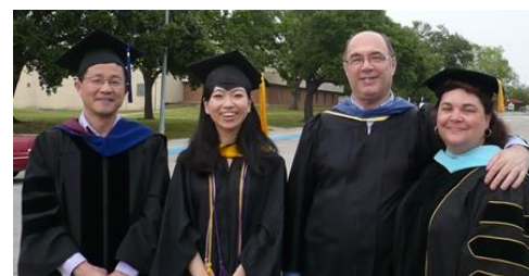
Graduation May 2014