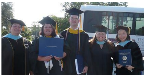
Graduation August 2014

This year, we graduated FIVE students from our Master's program. We would like to wish them each "Good Luck" as they begin the next phase of their lives. We also hope that they will keep in touch with us as they proceed in their life paths. Please keep us updated!