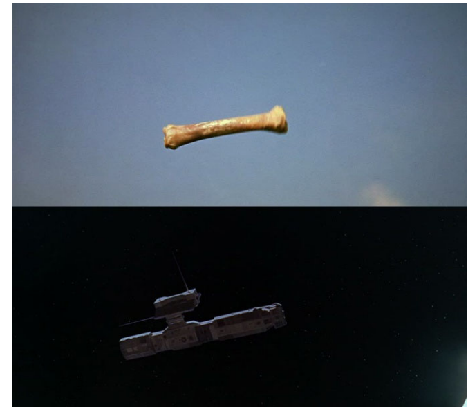
2001: A Space Odyssey