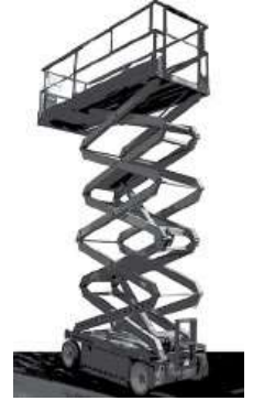
An example of a scissor lift.