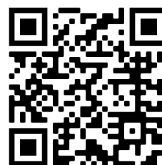
Student Disability Services Website

https://www.tamuc.edu/student-disability-services/