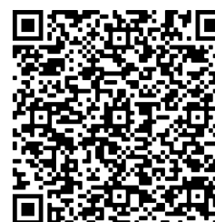
Academic Dishonesty Policy

Instructors at Texas A&M University-Commerce do not tolerate plagiarism and other forms of academic dishonesty. Instructors uphold and support the highest academic standards, and students are expected to do likewise. Penalties for students guilty of academic dishonesty include disciplinary probation, suspension, and expulsion. Here is the university policy, University Procedure 13.99.99.R0.10 ("Undergraduate Academic Dishonesty"): https://inside.tamuc.edu/aboutus/policiesproceduresstandardsstatements/rulesprocedures/13students/undergraduates/13.99.99.R0.03UndergraduateAcademicDishonesty.pdf