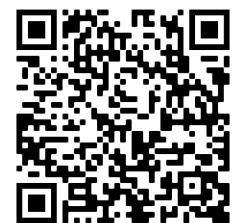
COVID return plan

This course meets face-to-face each week. We should aim to be respectful at all times during our class time. Cell phones and all other electronic devices must be turned off and out of sight when we are in class- if you have an emergency situation where you need to have your phone on, please let me know at the start of the class or via email prior to class time. I also ask that you are conscious of those around you. If you are not feeling well do not come to class. Per the university's return plan, we are resuming a pre-pandemic schedule of classes at full capacity. Classrooms will not be set up to allow for physical distancing. Masks are not required but they are encouraged, especially in public indoor settings where individuals are in close proximity to each other. Please do your part to keep yourself and others safe. For a full outline of protocols related to COVID management and guidance, you can visit the university's plan here (last updated 1/5/2022): https://www.tamuc.edu/wp-content/uploads/2022/01/COVID-19-Guideline-Changes-letterhead.pdf