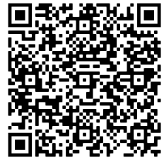
Concealed Carry Policy

Pursuant to PC 46.035, the open carrying of handguns is prohibited on all A&M Commerce campuses. Report violations to the University Police Department at 903-886-5868 or 9-1-1.