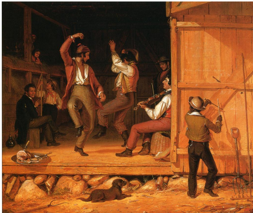
William Sidney Mount, The Dance of the Haymakers (1845) The Long Island Museum of American Art, History, and Carriages, Stony Brook, N.Y.