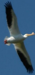
American White Pelican