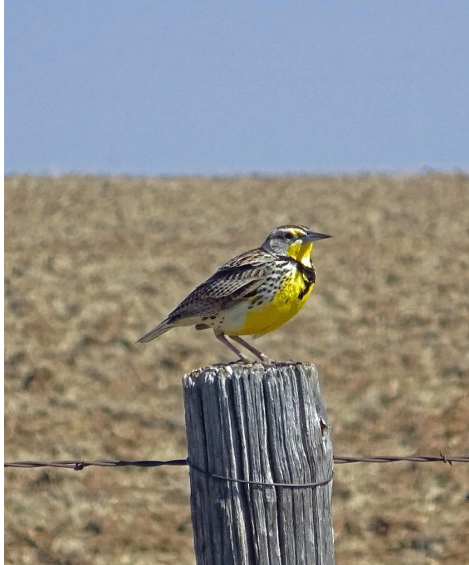
Western Meadowlark ( Sturnella neglecta ) in Armstrong County, Texas

Using your own words, describe the purpose of the article, the methods (if applicable), and the major findings. Describe the significance of the work to the field of study. In doing so, you also briefly review background articles related to the one you are reviewing. Make sure you cite these articles in your review. Include your opinion on the value of the article and its level of interest to you. Your review must be in MS-Word format and submitted by the due date. Reviews must be in Times New Roman, 12 point font, double spaced, no extra spaces between paragraphs, with 1" margins on all sides. Include a title page with your name and the title of the paper you are reviewing. Your review should be no less than six pages and no more than 10 pages, not including the title page. If you include figures and tables, append them to the back of the review. Figures and tables do not count toward the page limit. Reviews must be submitted through the Dropbox in eCollege