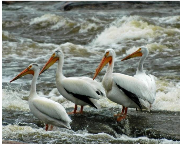
American White Pelicans ( Pelecanus erythrorhynchos ) at Whitemouth Falls, Manitoba, Canada

Ornithology is the study of birds. According to the International Ornithological Congress, there are over 10,000 described living species of birds that fall into 228 families in 40 orders. That put birds at a distant second place (bony fishes have 30,000 species) for the most diverse vertebrate class. Despite this, and because of their largely terrestrial, diurnal, and conspicuous nature, birds are very well studied and much of what we know about the behavior, ecology, and physiology of wild animals comes from research on birds.