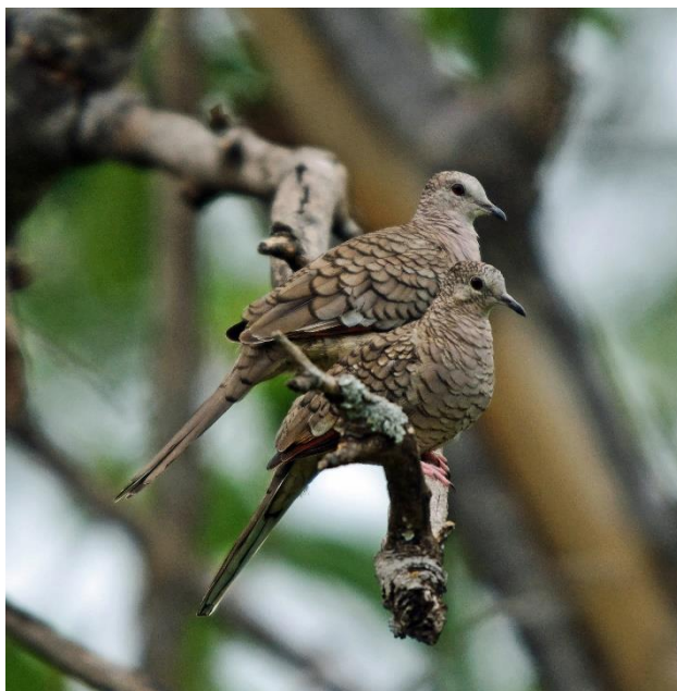
Inca Doves ( Columbina inca ) in Sulphur Springs, Texas

Each chapter will be followed by a chapter quiz. The chapter quiz will consist of 10 multiple choice questions. Quizzes will cover all material in the chapter, including information in figures and tables. Quizzes will be timed, and students will have 30 minutes to complete the quiz. You will be expected to have full comprehension of the material. As a result, some questions will require that you apply concepts covered in the chapter to examples that are not specifically mentioned in the textbook.