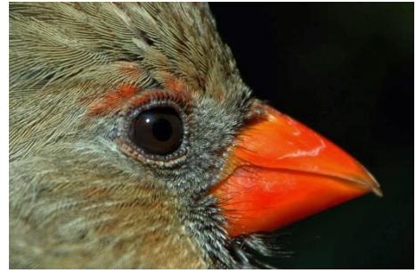
Female Northern Cardinal ( Cardinalis cardinalis ) near Commerce, Texas