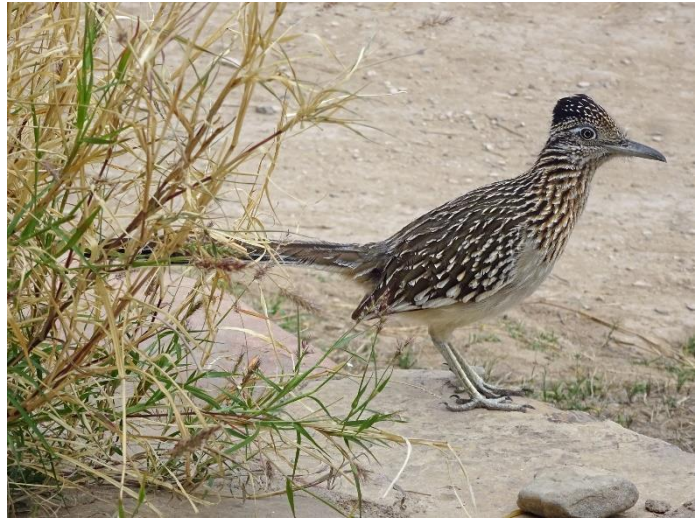
Greater Roadrunner ( Geococcyx californianus ), Big Bend National Park, Texas

You are responsible for ensuring that you complete all of the tests and chapter reviews in a timely manner. Make sure you have the textbook prior to the start of class. When you are ready to take a test, make sure you have both the textbook and your chapter review available to refer to. Review the materials beforehand. Book-marking important sections of the textbook may also be very useful and help you look up answers more quickly. Detailed descriptions of the tests and assignments are provided below. You are responsible for being familiar with these instructions and in following them exactly as provided.