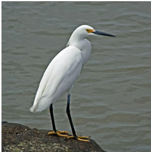
Snowy Egret ( Egretta thula ) at Galveston Island, Texas

With the enormous body of research on birds it is not possible to cover everything during even a long semester, let alone a short summer semester. Because of this, I have selected chapters out of the textbook that tend to highlight avian behavior and ecology. As a behavioral ecologist, I find these aspects of the avian world to be particularly interesting and I hope that you will feel the same way.