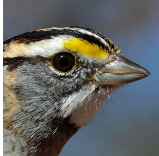
White-throated Sparrow ( Zonotrichia albicollis ) near Commerce, Texas