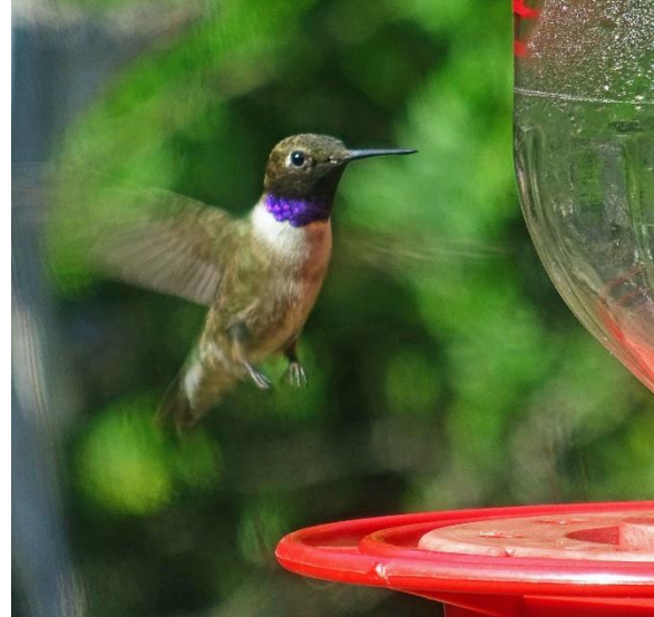
Male Black-chinned Hummingbird ( Archilochus alexandri ) at Pedernales Falls State Park, Texas

Your chapter reviews must be in MS-Word format and submitted by the due date indicated in the course D2L shell. Reviews not in MS-Word format will receive a grade of zero. Put your name on your review. Reviews must be written using Times New Roman, 12-point font, double spaced, no extra spaces between paragraphs, with 1” margins on all sides. Include a title page with your name and the title of the chapter you are reviewing. You will lose points for not following this format.