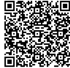
Concealed Carry Policy

Texas Senate Bill - 11 (Government Code 411.2031, et al.) authorizes the carrying of a concealed handgun in Texas A&M University-Commerce buildings only by persons who have been issued and are in possession of a Texas License to Carry a Handgun.