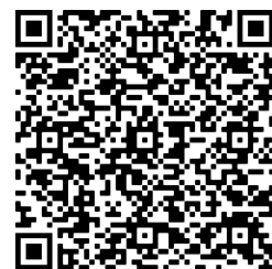
Academic Dishonesty Policy

Instructors at Texas A&M University-Commerce do not tolerate plagiarism and other forms of academic dishonesty. Instructors uphold and support the highest academic standards, and students are expected to do likewise. Penalties for students guilty of academic dishonesty include disciplinary probation, suspension, and expulsion. Here is the university policy, University Procedure 13.99.99.R0.10 ("Undergraduate Academic Dishonesty"): https://inside.tamuc.edu/aboutus/