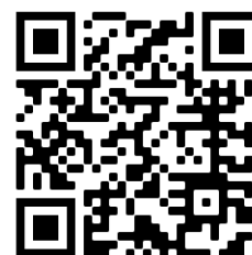
Student Disability Services Website

Texas A&M University-Commerce Velma K. Waters Library Rm 162 Phone (903) 886-5150 or (903) 886-5835 Fax (903) 468-8148 Email: StudentDisabilityServices@tamuc.edu Website: Office of Student Disability Resources and Services https://www.tamuc.edu/student-disability-services/