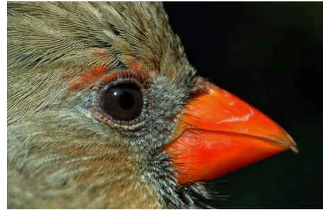
Female Northern Cardinal ( Cardinalis cardinalis ) near Commerce, Texas

This course looks at current research in the areas of avian evolution, systematics, foraging ecology, mate choice, mating systems, and reproductive behavior and ecology.