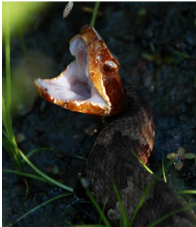
Western Cottonmouth, Hunt Co., Texas

The strategy, therefore, is to make sure you read all of the material beforehand and study it to make sure you are entirely familiar with it. Then, when you are ready for the test, make sure you have the textbook and the PowerPoint slides in front of you so that you can quickly find the answers to the questions.