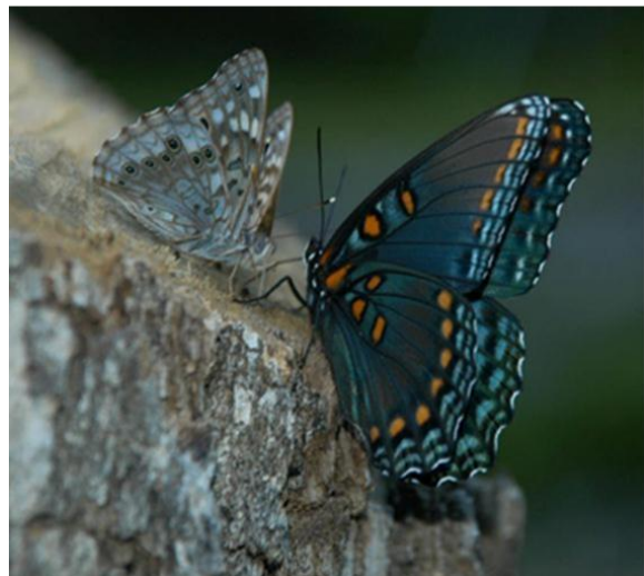
Hackberry butterfly (left) and Red-spotted Purple (right) (Hunt Co., Texas)