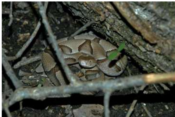
Southern Copperhead, Hunt Co., Texas

All students will have an additional Bonus Point opportunity by participating in a Deer Age/Antler Workshop that is hosted by TPWD in the fall, typically in October or November. The exact date will be announced. All students who participate in this activity will be granted 2.5 percent that will be added to their final grade