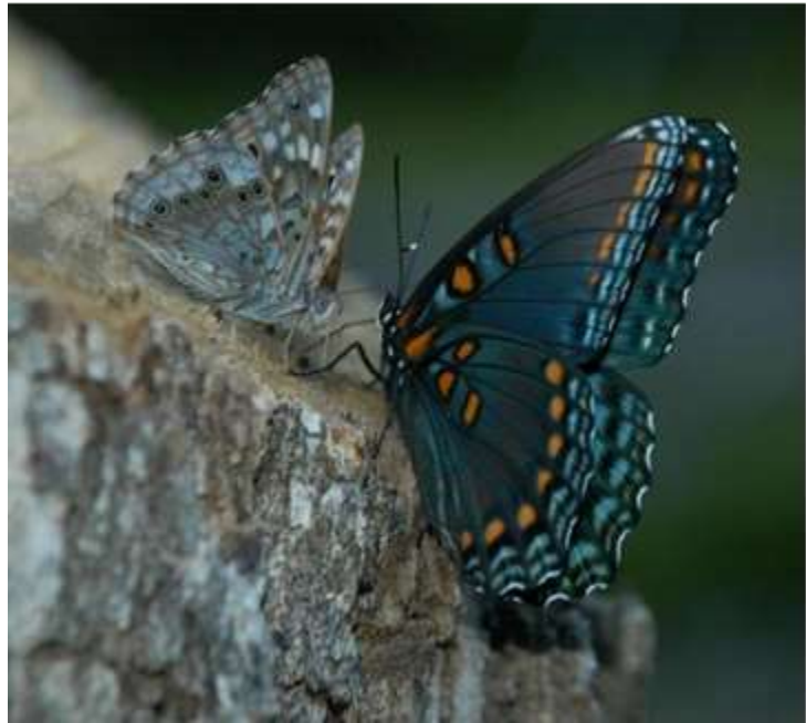
Hackberry butterfly (left) and Red-spotted Purple (right) (Hunt Co., Texas)