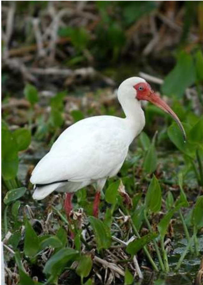
White Ibis in Louisiana wetland