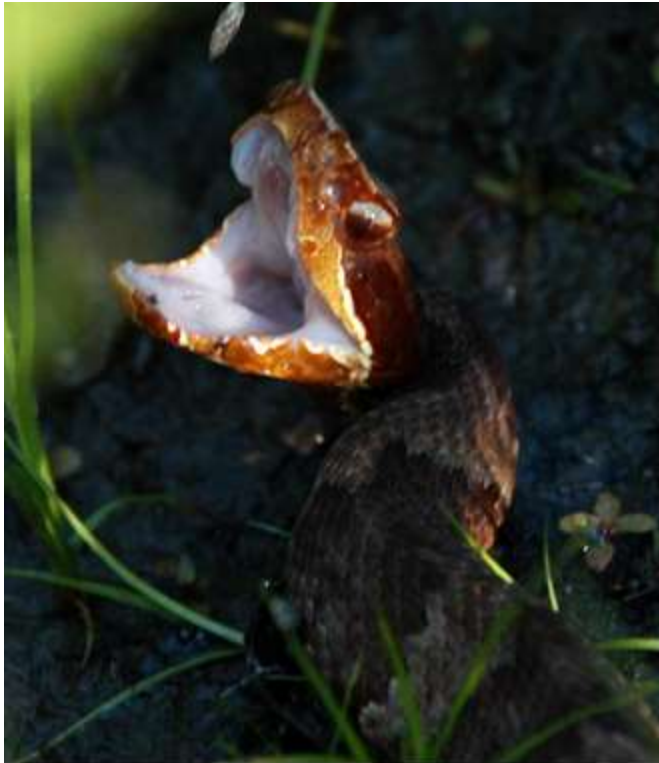
Western Cottonmouth, Hunt Co., Texas

you have the textbook and the PowerPoint slides in front of you so that you can quickly find the answers to the questions.