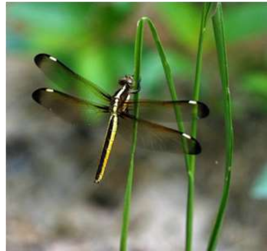
Spangled Skimmer, Hunt Co., Texas

ANY STUDENT WHO DOES NOT COMPLETE THE ENTRANCE TEST WILL HAVE 2.5 PERCENT SUBTRACTED FROM THEIR COURSE GRADE. SIMILARLY, ANY STUDENT WHO DOES NOT COMPLETE THE EXIT TEST WILL HAVE 2.5 PERCENT SUBTRACTED FROM THEIR GRADE. STUDENTS WHO DON'T COMPLETE ANY OF THESE TESTS WILL HAVE 5 PERCENT SUBTRACTED FROM THEIR GRADE