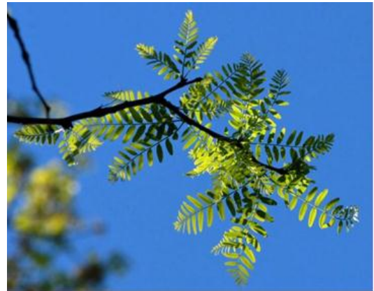
Honey Locust in Hunt Co., Texas

ANY STUDENT WHO DOES NOT COMPLETE ALL EIGHT OF THE ENTRANCE TESTS WILL HAVE 6 PERCENT SUBTRACTED FROM THEIR COURSE GRADE. SIMILARLY, ANY STUDENT WHO DOES NOT COMPLETE THE EXIT TEST WILL HAVE 2.5 PERCENT SUBTRACTED FROM THEIR GRADE. STUDENTS WHO DON'T COMPLETE ANY OF THESE TESTS WILL HAVE 8.5 PERCENT SUBTRACTED FROM THEIR GRADE