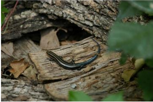
Five-lined Skink, Hunt Co., Texas

to monitor population status and hunter harvests. All students who participate in this activity will be granted 5 points that will be added to their final grade