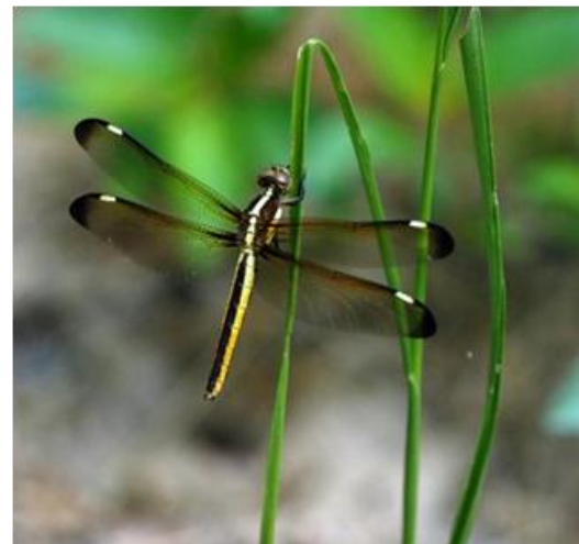
Spangled Skimmer, Hunt Co., Texas