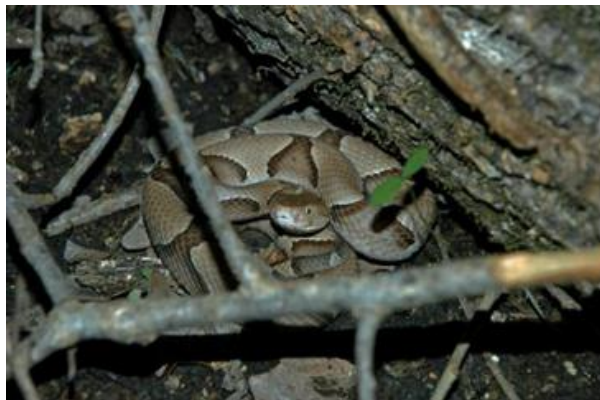
Southern Copperhead, Hunt Co., Texas