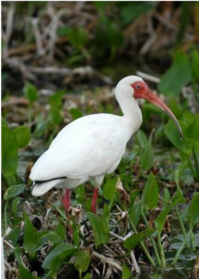
White Ibis in Louisiana wetland