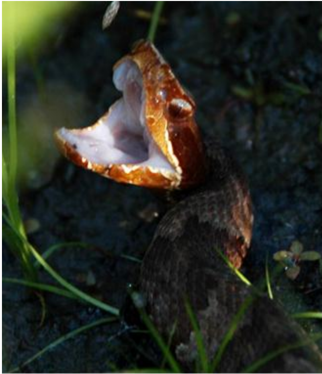
Western Cottonmouth, Hunt Co., Texas

There will be two term tests, each based on multiple chapters in Bolin and Robinson including material from both the textbook and the PowerPoint slides. These tests will consist of 30 multiple choice questions and you will have 40 minutes to complete the test.