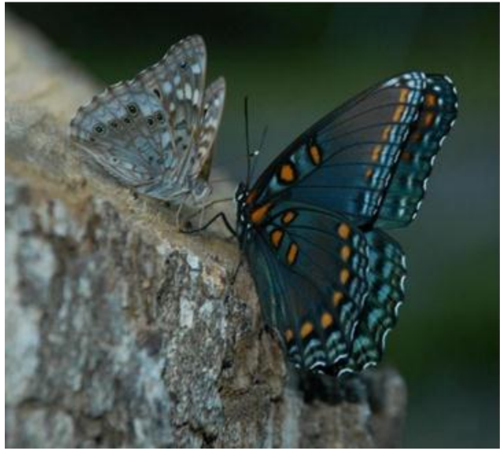
Hackberry butterfly (left) and Red-spotted Purple (right) (Hunt Co., Texas)