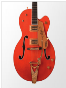
G6120 Chet Atkins Hollow